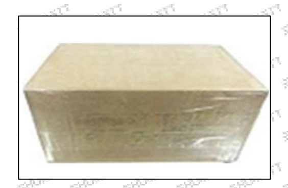
Pic No. 2 Domestic express packaging:

Minors are prohibited from using transparent tape, yellow tape, black wrapping protective film, and white wrapping protective film to avoid personal injury.